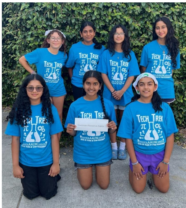
Camp Hopper Attendees.