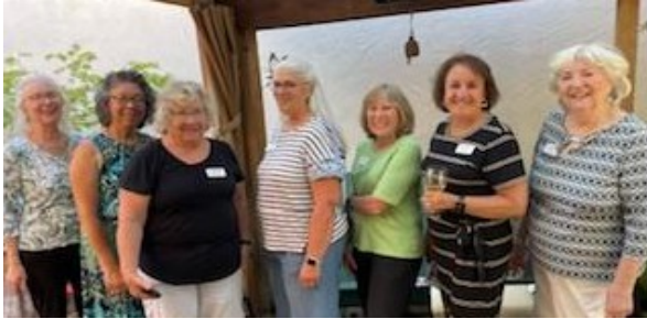
2023/24 Outgoing Board