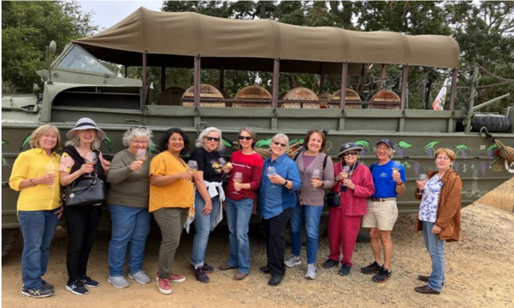
The Duck Boat cruisers