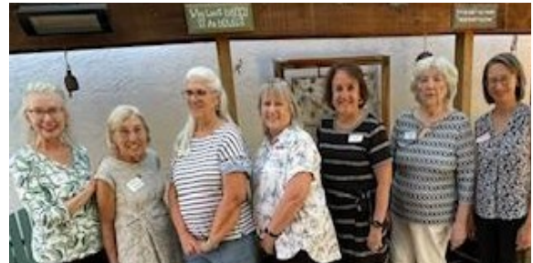
2024/25 Incoming Board

We would love to share photos of your interest groups!