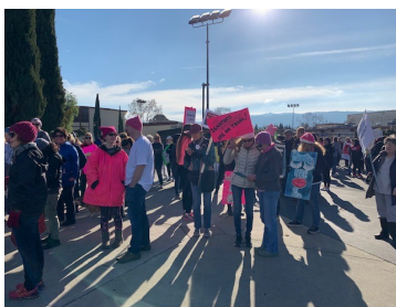
Women's March on January 18

As we continue to use Evite to promote our social programs, please let me know if you are experiencing difficulties opening the program. Evite provides our hosts with up to date information about how many are members will be attending. Soon, we will be adding a payment option to Evite which will allow you to prepay events on line (if there is a charge). We will also be rolling out the "what to bring" or "what help is needed" feature on Evite.