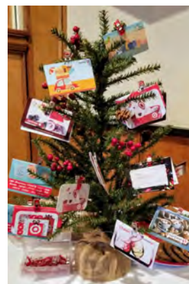
Our Tri-Valley Haven Gift Cards Holiday Party