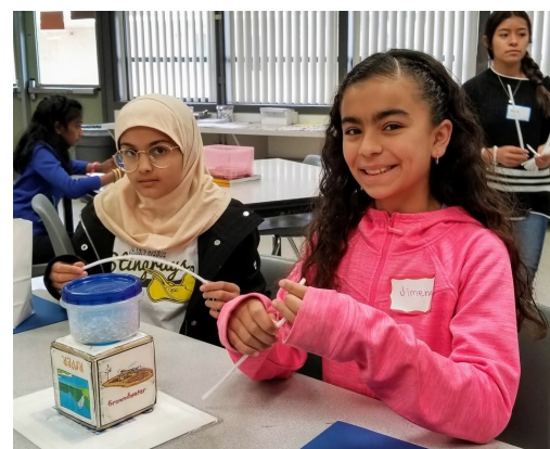
Another STEAM Divas on Oct. 29 photo

PUBLICITY - Roz Wright— roz@aauw-lpd.org