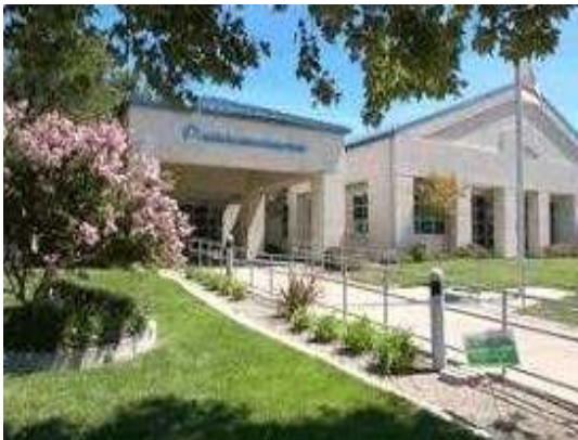
Dublin San Ramon Services District Board Room 7051 Dublin Blvd., Dublin