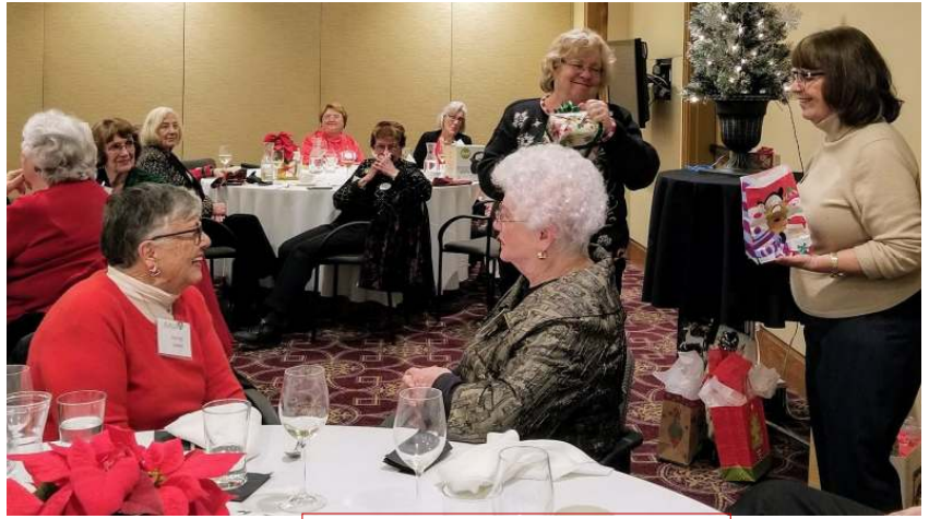
Giving out White Elephant gifts.