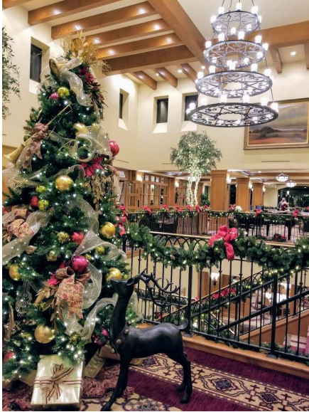
Stoneridge Creek Lobby December 2017