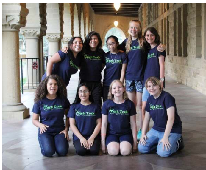
LPD 2017 Tech Trekkers