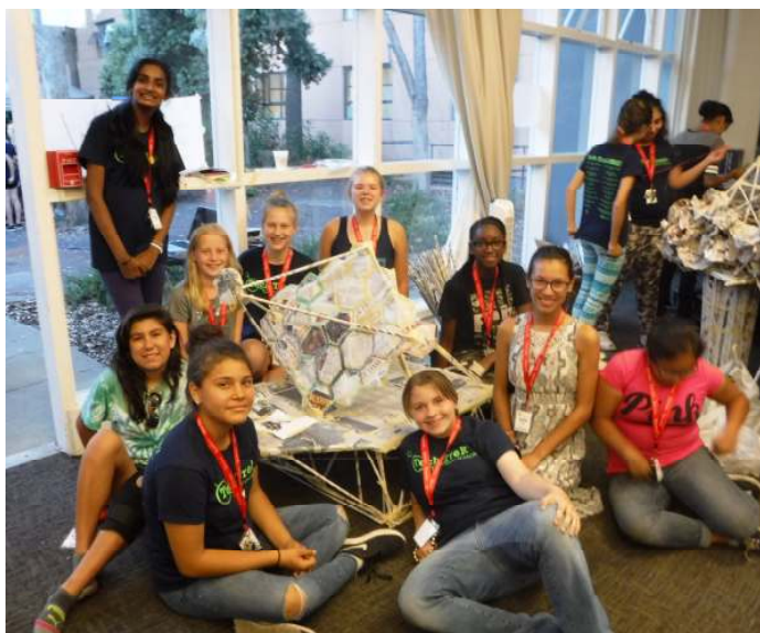
Build It Night!