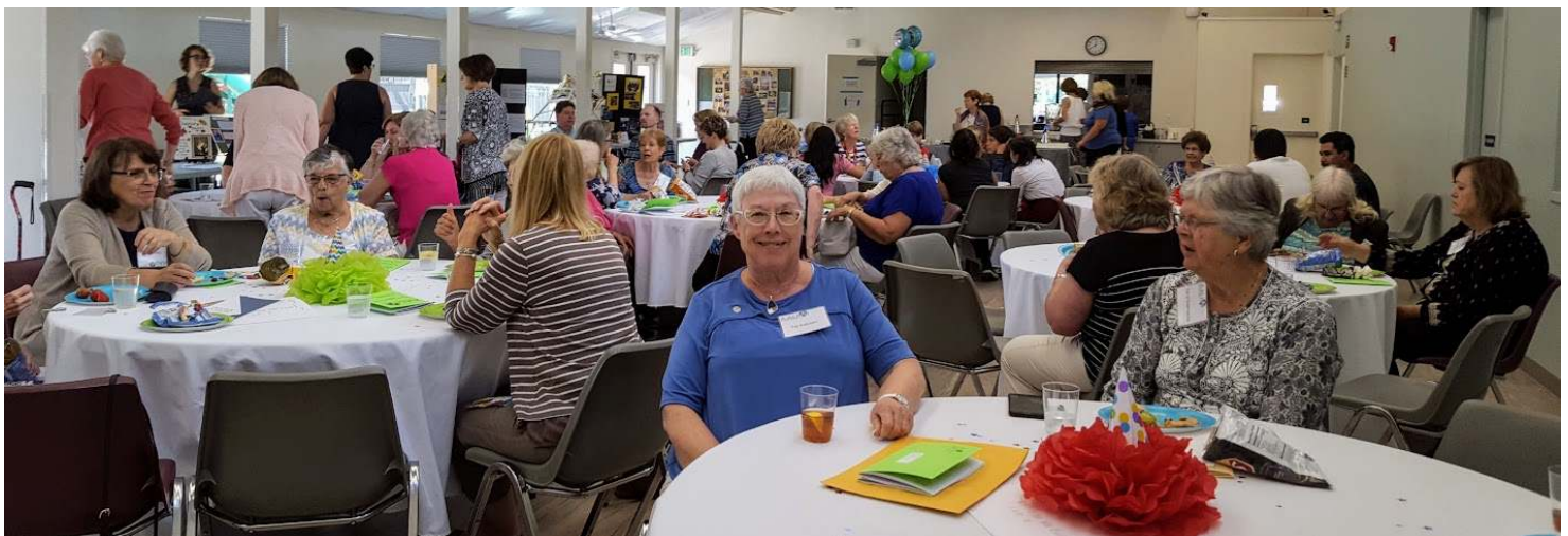
Meet & Greet Luncheon, Saturday, September 16 @ Lynnewood United Methodist Church