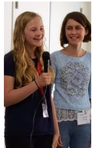
Two of our 2017 Tech Trekkers at 9/16 meeting