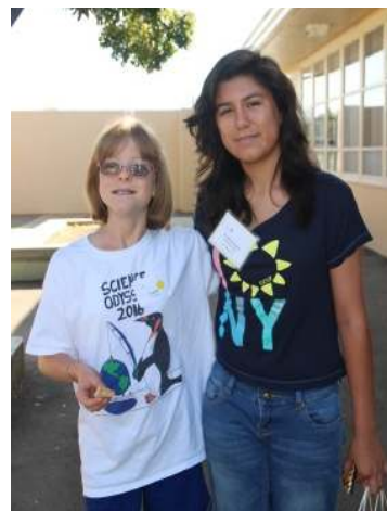
Former Tech Trekkers (2013-2017) volunteered their time to serve as STEAM Diva Workshop Aides and student assistants.